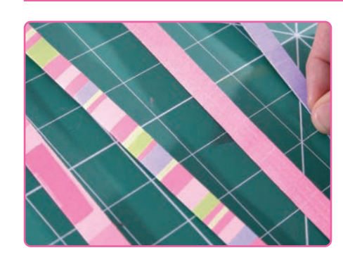
Cut strips of four different papers to measure 1½" wide and fold them in half. Designate your different papers A, B, C and D. Secure an iris design to the front of an aperture card using low-tack tape. Tape strip 1A over the pattern at the 1A position. Cut the paper to fit, and secure both ends.