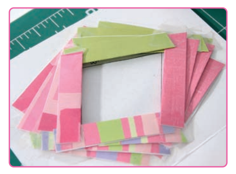
When you've completed the number Osequence, remove the pattern from the front and, using a strong adhesive, place a piece of cardstock or decorative paper over the pieced and taped papers.